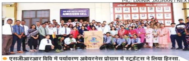
एसजीआरआर विवि में पर्यावरण अवेयरनेस प्रोग्राम में स्टूडेंट्स ने लिया हिस्सा.