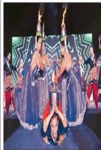
नृत्य की प्रस्तुति देते छात्र-छात्राएं।