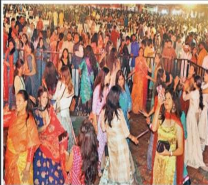
एसजीआरआर विवि में आयोजित नवरंग डांडिया कार्यक्रम में डांडिया करते छात्र-छात्राएं व शिक्षकगण