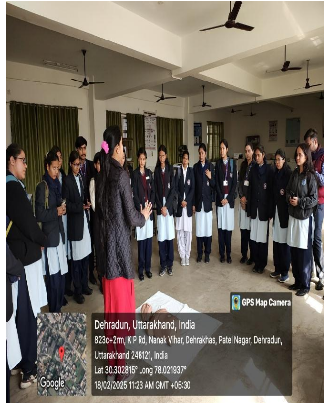
Dehradun, Uttarakhand, India 823c+2rm, K P Rd, Nanak Vihar, Dehrakhas, Patel Nagar, Dehradun, Uttarakhand 248121, India Lat 30.302815° Long 78.021937° 18/02/2025 11:23 AM GMT +05:30