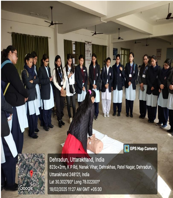
Dehradun, Uttarakhand, India 823c+2rm, K P Rd, Nanak Vihar, Dehrakhas, Patel Nagar, Dehradun, Uttarakhand 248121, India Lat 30.302793° Long 78.022001° 18/02/2025 11:27 AM GMT +05:30