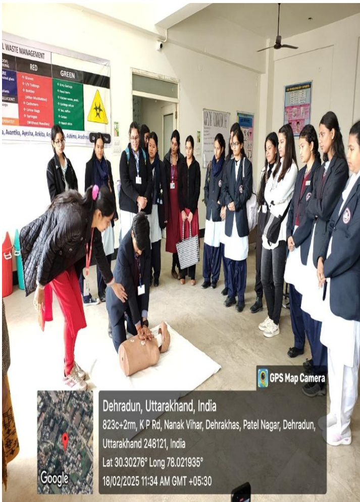
Dehradun, Uttarakhand, India 823c+2rm, K P Rd, Nanak Vihar, Dehrakhas, Patel Nagar, Dehradun, Uttarakhand 248121, India Lat 30.30276° Long 78.021935° 18/02/2025 11:34 AM GMT +05:30