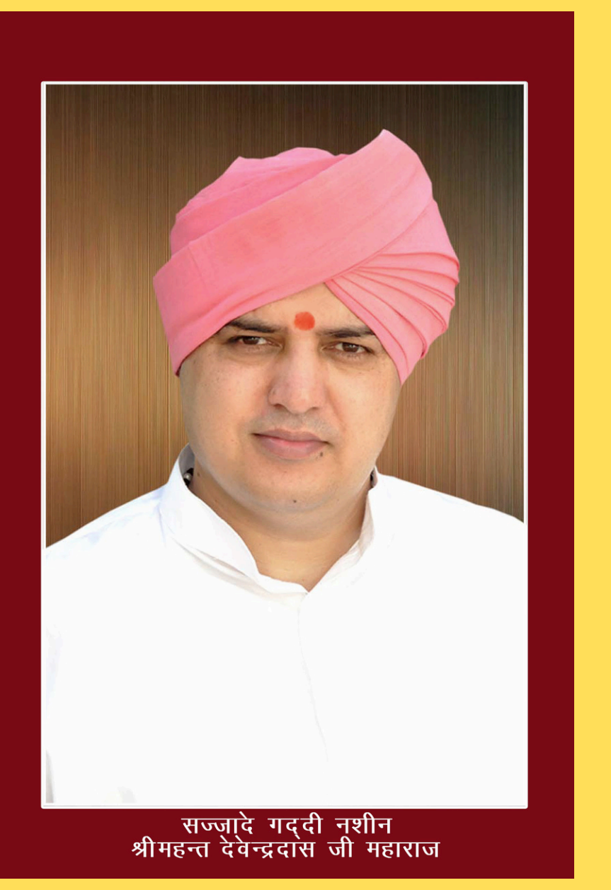
HONOURABLE PRESIDENT SHRI GURU RAM RAI UNIVERSITY