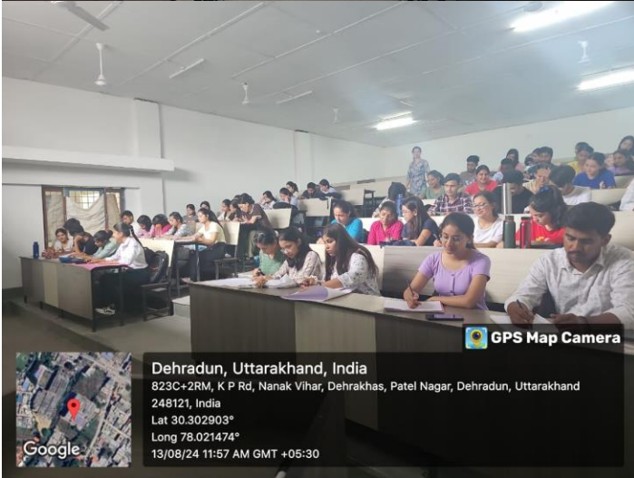
Dehradun, Uttarakhand, India 823C+2RM, K P Rd, Nanak Vihar, Dehradun, Uttarakhand 248121, India Lat 30.302903° Long 78.021474° 13/08/24 11:57 AM GMT +05:30