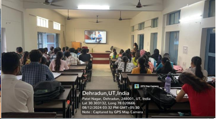
Dehradun, UT, India Patel Nagar, Dehradun, 248001, UT, India Lat 30.303132, Long 78.020666 08/12/2024 03:32 PM GMT+05:30 Note : Captured by GPS Map Camera