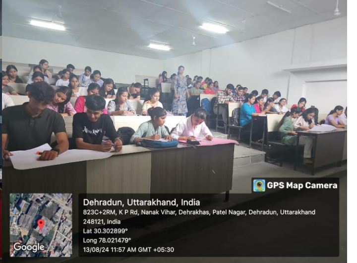
Dehradun, Uttarakhand, India 823C+2RM, K P Rd, Nanak Vihar, Dehradun, Uttarakhand 248121, India Lat 30.302899° Long 78.021479° 13/08/24 11:57 AM GMT +05:30