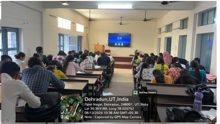
Dehradun, UT, India Patel Nagar, Dehradun, 248001, UT, India Lat 30.303189, Long 78.020752 08/13/2024 10:38 AM GMT+05:30 Note : Captured by GPS Map Camera