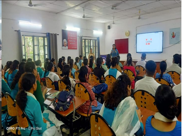
OPPO F11 Pro