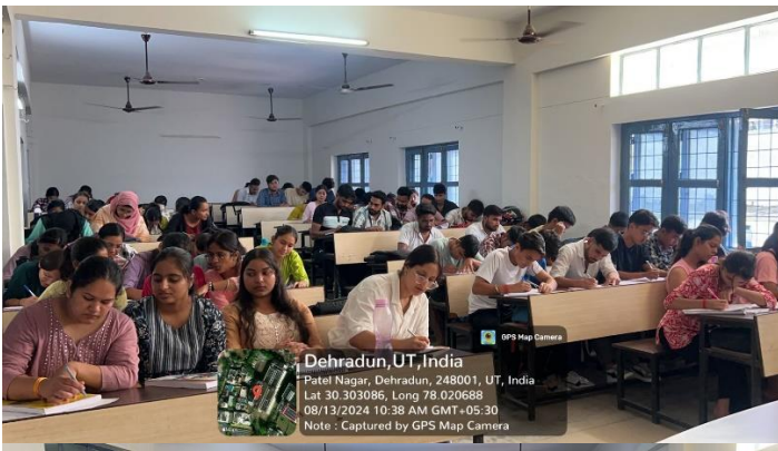
Dehradun, UT, India Patel Nagar, Dehradun, 248001, UT, India Lat 30.303086, Long 78.020688 08/13/2024 10:38 AM GMT+05:30 Note : Captured by GPS Map Camera